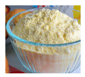
corn muffin mix