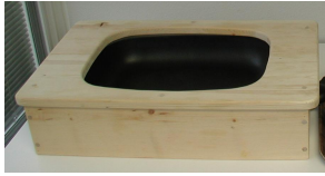
Electric skillet, preheated to 350°