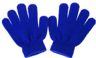
gloves or oven mitts