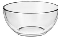
small mixing bowl