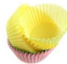
paper muffin liners