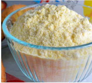
corn muffin mix